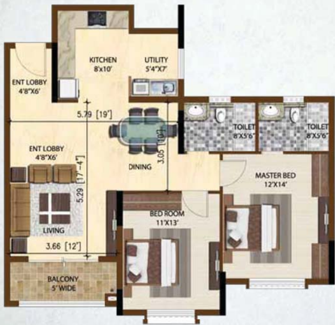
2 Bedroom | 1270 sq.ft.